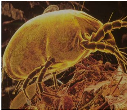
Scanning electron micrograph of surface dwelling mite

The treatment regime employed at WCMC required treatment of individual animals and preparation and provision of medicated nestlets to every cage at cage change. Over 4000 cages were treated during a 7-week period. Following treatment, an intensive follow-up testing program was implemented. Several thousand skin scrape samples were collected and evaluated microscopically. All samples examined were mite free.