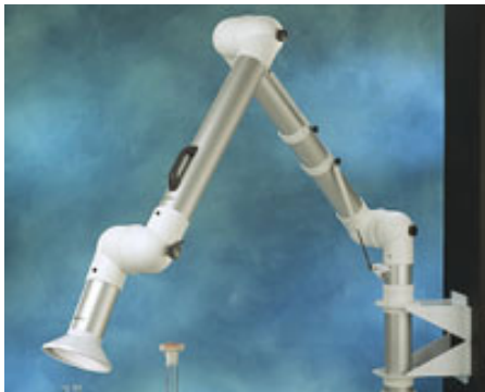
Air extraction arm of snorkel system used to scavenge WAG