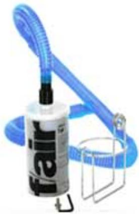
These charcoal canisters passively trap halogenated waste gas ensuring the safety of your staff