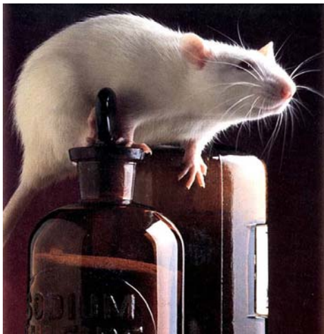
Pain Control in Rodents